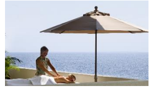
Lomi Lomi Massage from Ho'ola Spa Tradition Hawaiian Treatment at Sheraton Kona's Ho'ola Spa.