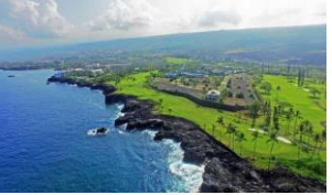
Golf Kona Country Club Located next to the Outrigger Kona, Kona Country Club offers stunning ocean views and mountain breezes.