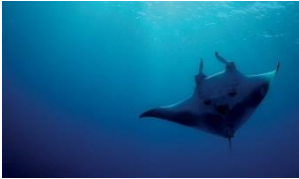
Night time Manta Ray Snorkel Watch these gentle giants dance ballet in the sea at Keauhou Bay.