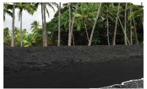
Punaluu Black Sand Beach South of Volcanoes National Park; experience a volcanic black sand beach & bring a picnic.