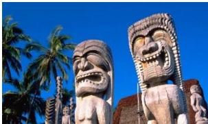
Puuhonua O Honaunau National Park City of Refuge; hike the Kings Trail, Snorkel at "Two Steps"