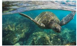
Kaloko-Honokohau National Historical Park North of Kailua Village, ancient fish ponds and turtles.