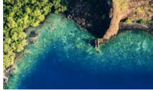
Kealakekua Bay Snorkel Cruise Experience world famous snorkeling at this preserve. Boats depart daily from Keauhou.