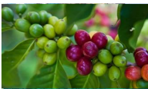
Kona Coffee Farm Tour Learn about our famous coffee with a coffee tour containing detailed knowledge of the region.