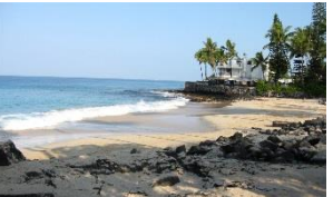
Magic Sand/Laaloo Beach Beautiful white sand beach cove that's suitable for swimming, boogie boarding, etc. 5 minutes from Sheraton Kona.