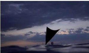
Cultural/Historical Sailing Tours of Keauhou Discover the history of Keauhou Bay.