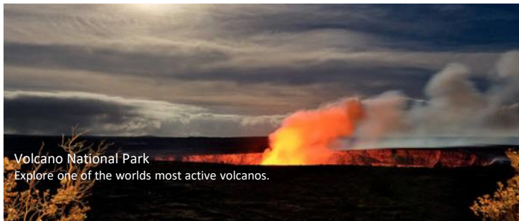
Volcano National Park Explore one of the worlds most active volcanos.