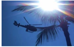
Helicopter Tours Experience volcanos, dramatic waterfalls from the sky