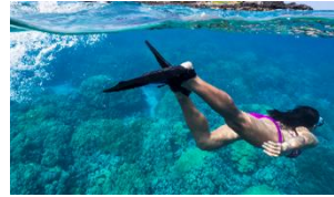
Kahaluu Snorkling One of only a handful of beaches in Hawaii with such a large fish population, great snorkeling. 5 minutes from Outrigger Kona.