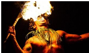
Luuu Dinner & Show Feast & Fire - shares stories of the ahupuaa Keauhou. Monday & Thursday nights at Outrigger Kona.