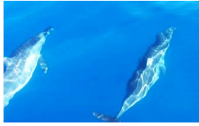
Dolphin/Whale Watching Tours Site seeing tours in their natural habitat. Boats depart daily from Keauhou.