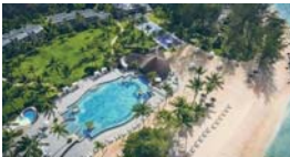
Outrigger Mauritius Beach Resort 181 Rooms & Suites