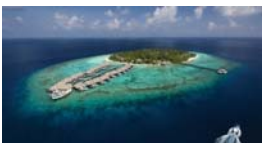
Outrigger Konotta Maldives Resort 53 Villas