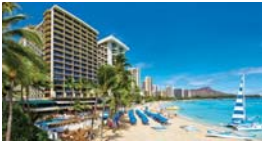
Outrigger Waikiki Beach Resort 524 Rooms & Suites