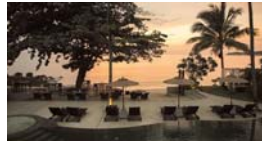
Outrigger Koh Samui Beach Resort 52 Rooms & Suites