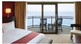
Outrigger Guam Beach Resort 600 Rooms & Suites