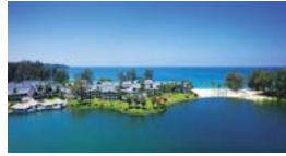
Outrigger Laguna Phuket Beach Resort 255 Rooms & Suites