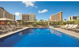
Waikiki Beachcomber by Outrigger 496 Rooms & Suites