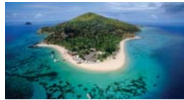
Castaway Island, Fiji 65 Private Bungalows