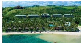
Outrigger Fiji Beach Resort 245 Rooms & Suites